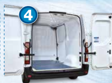
STEP 4: BULKHEAD AND BACK DOORS