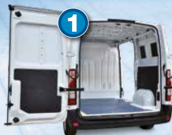
STEP 1: FLOOR