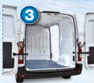
STEP 3: SIDE WALLS