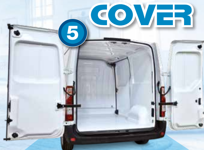
STEP 5: FINISH