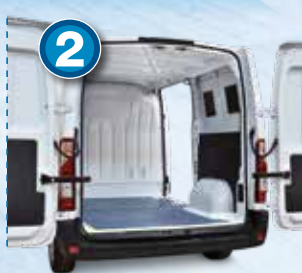
STEP 2: ROOF