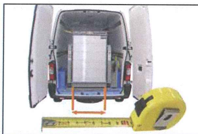
S958 Non-standard platform width