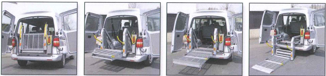
S957 Foldable platform for reduction in required fitting height, and for maximum driver's view through the rear vehicle doors (model shown = DH-P20, DH-P21 is excl. safety gates)