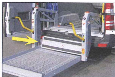
S955 Bridge plate mounted to platform (side gates = non standard)