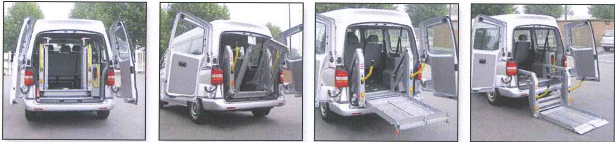
S953 Vertically folding platform for clear and free passage through the doorway (model shown = DH-P20, DH-P21 is excl. safety gates)